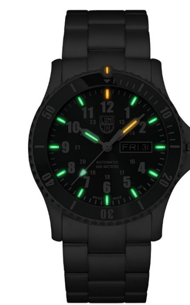
Night Vision View